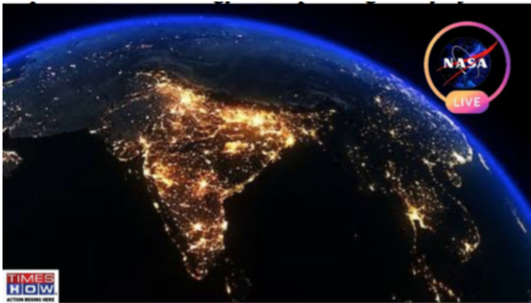
Figure 2: Fake/altered satellite image attributed to NASA

Enthusiastic use of fireworks released considerable pollution , a curious response to a respiratory viral pandemic. Shutting off the national power grid for 9 minutes necessitated unprecedented and drastic action by personnel behind the scenes. Following this event, fake images of an India ablaze with lights circulated as authentic “NASA” maps (Figure 2).